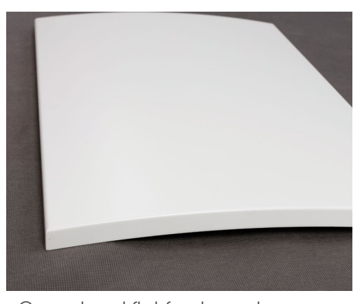
Curved and flat fronts made of painted MDF