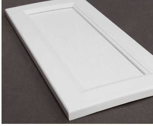
Curved solid wood fronts