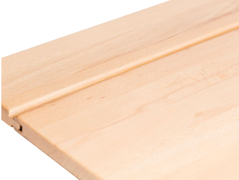
Modular solid fronts