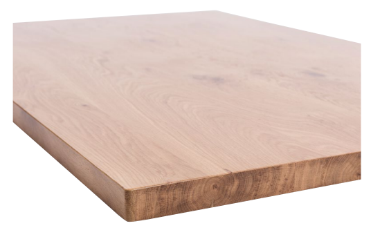
Veneered tops and fronts