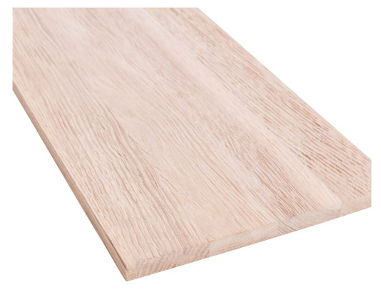
Structured decorative elements