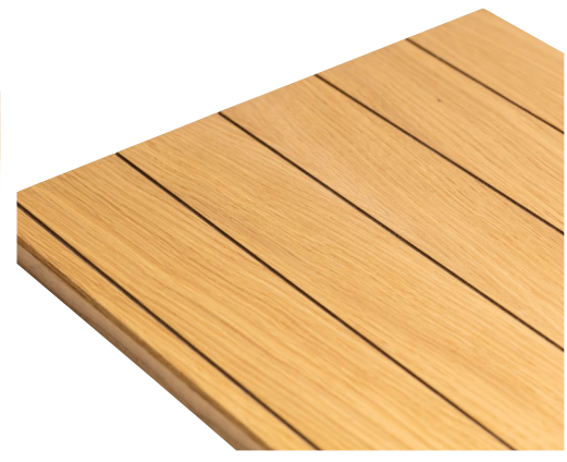
Veneered end panels