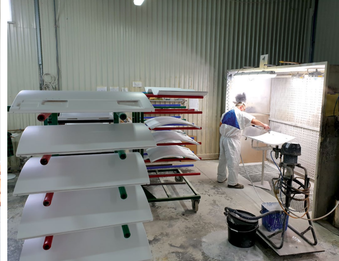
2 painting lines, 4 spray booths adaptation of painting technology to customer requirements