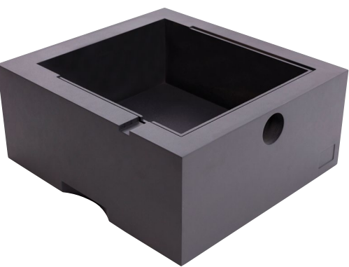
Wood and MDF elements for various industrial applications