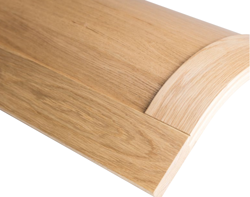
5-piece curved doors