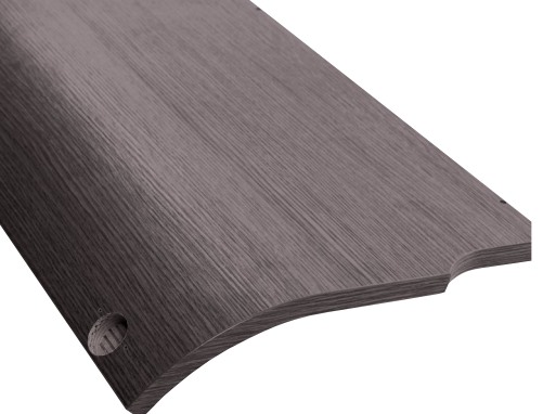
Curved veneered and laminated elements