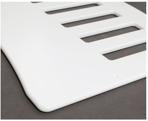
bed components made of painted MDF